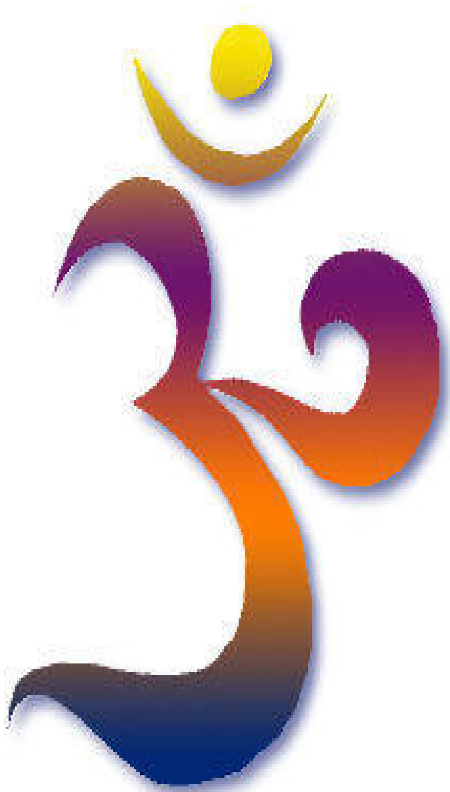
The aum symbol